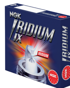
Iridium IX packaging